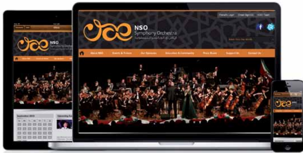
NSO Symphony Orchestra's Website www.uaenso.org